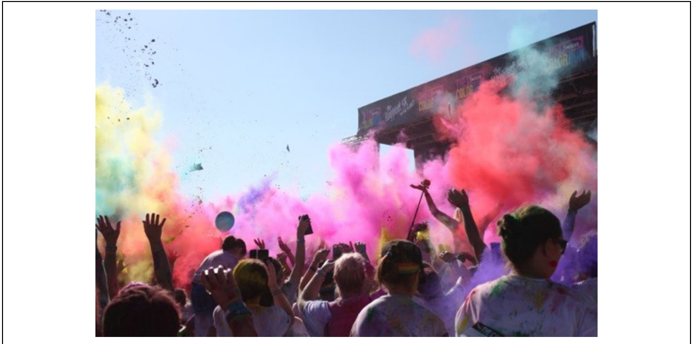
Figure 3. Health and fitness. No consent needed for this image as the people are unidentifiable.