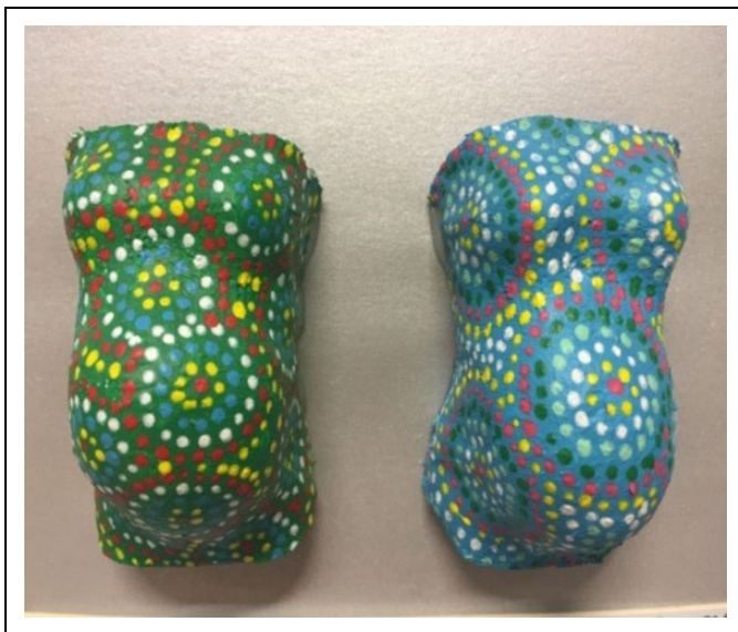
Figure 4. Working as a midwife. Another image that did not need written consent and that is very creative.

participants to express themselves through their chosen images. This methodology allowed participants to think and reflect prior to interview and to capture their ideas through photography and on paper. The visual images created subsequent knowledge; elicited memories, meanings, and deep emotions; and brought different layers and insights to the research. The photographs, verbal responses, and the written data provided trustworthiness and rigor through member checking. Joint theorizing was conducted in the photo elicitation interviews as participants spoke about and analyzed their own materials in