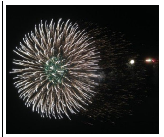
Figure 2. Celebration. Another example of how a participant represented celebration without the need to gain consent for images of people.

The photographs produced by the participants in this study were impressive—they showed beautiful, creative, and descriptive images of their sources of meaning in life and enhanced the written data, drawing out deeper meanings. Participants were very creative in the ways they presented the images of people in their photographs and followed the consenting requirements. For example, one participant