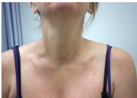
Figure 2 Cosmetic result at 6 weeks post surgery.

In 1947 Petit and Clark successfully treated a patient suffering from GPHPT [10]. Under local anaesthesia and supplemented only by nitrous oxide and oxygen, they were able to remove a palpable parathyroid adenoma