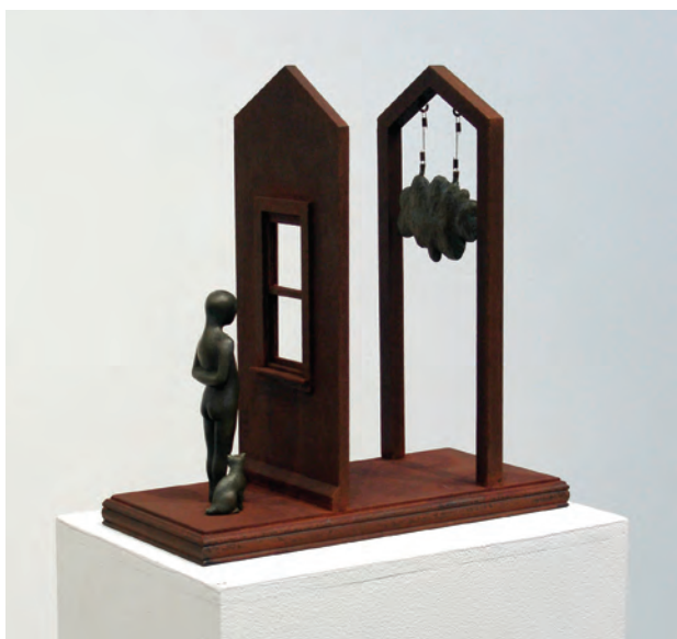
Seize the Day , 2008, patinated cast bronze, stainless steel wire, unique state, 35 x 33.5 x 15.5cm