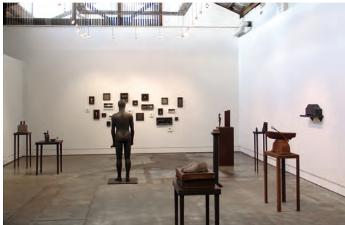
Installation view, Something Other Than Itself , Brenda May Gallery, Sydney 2010