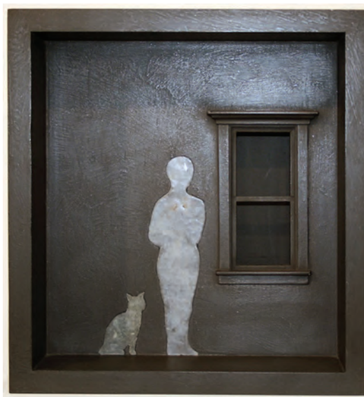
Darkness Outside , 2009, lead, timber, 28.5 x 27 x 11cm

is made of a thousand such decisions, that each action has an ethical shadow.