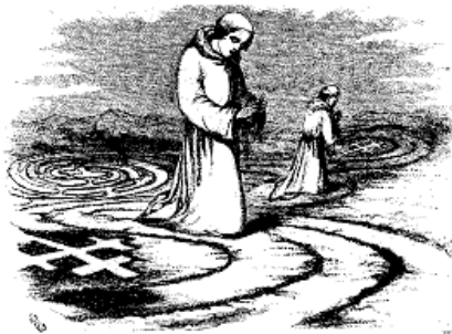
Figure 5 Monks Praying on a Turf Labyrinth

The labyrinths on the cathedral floors became known as “the path to Jerusalem,” a symbol of pilgrimage. This is reflected in etchings and drawings of the eighteenth and nineteenth century, which show members of the congregation sedately walking on the paths of the labyrinth, while other drawings show monks praying on their knees demurely crawling around the path of a turf labyrinth. (Figure 5) These images of the contemplative