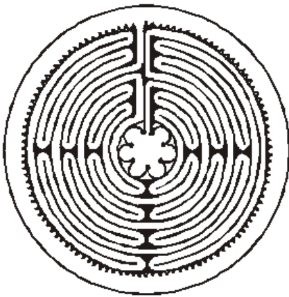
Figure 1 Plan of the Chartres Labyrinth

Within many of the great Gothic cathedrals such as Chartres Cathedral, San Michele Maggiore, Pavia, and San Vitale, Ravenna, lay large floor labyrinths. Most of these face the altar as the dominant feature of the nave, and are either round or