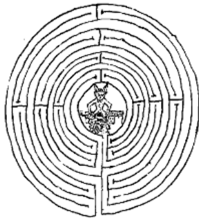
Figure 3 A Church Labyrinth Style in a Tenth-century Computus Manuscript

hundred years earlier than the floor labyrinths in the European cathedrals. 3