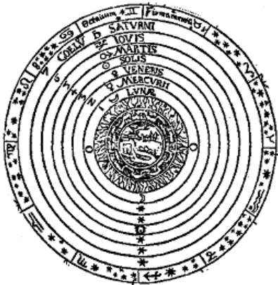
Figure 6 The Medieval Concept of the Universe

a labyrinth that consisted of twelve concentric circuits. These twelve circuits of the medieval labyrinths may have represented the medieval concept of the universe. (Figure 6)